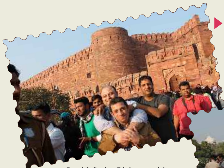
Iraqi & Syrian Diplomats visit Agra Fort on 20 January 2018