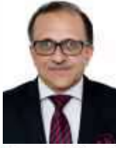
From the Dean's desk