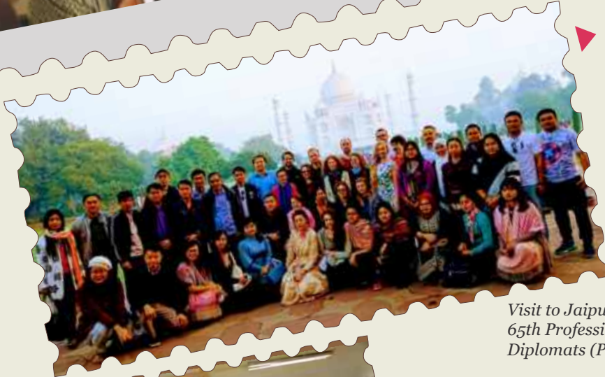
12 Association of Southeast Asian Nations (ASEAN), 4th Asia-Europe Meeting (ASEM) and 1st Special Course for Myanmar diplomats visit the Taj Mahal, Agra on 18 November 2018