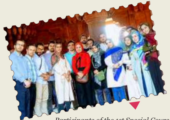
Participants of the 1st Special Course for Tunisian diplomats visit Rashtrapati Bhawan on 2 November 2018