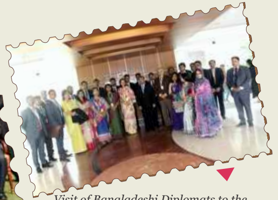
Visit of Bangladeshi Diplomats to the office of Tech Mahindra, Hyderabad on 26 November 2018