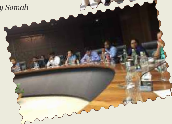
Participants of the 66th Professional Course for Foreign Diplomats (PCFD) visit the office of Infosys Limited on 1 October 2018