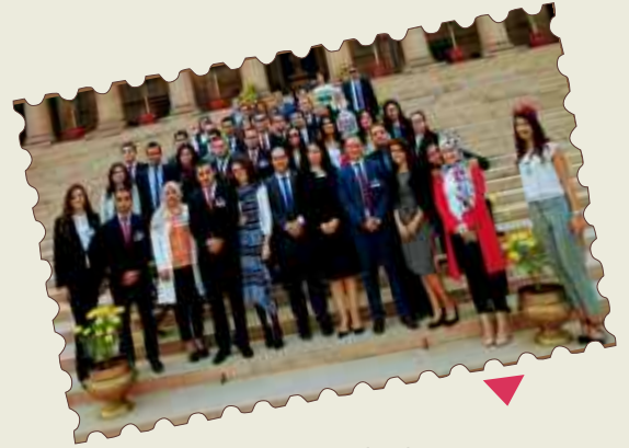
Visit to Fatepur Sikri by Iranian diplomats on 2 December 2018