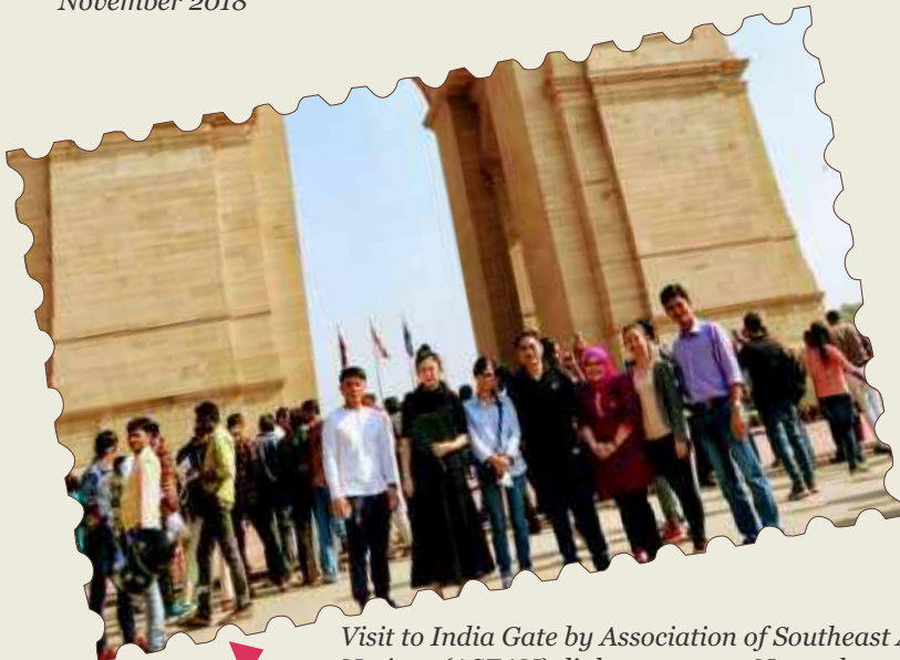
Visit to India Gate by Association of Southeast Asian Nations (ASEAN) diplomats on 25 November 2018