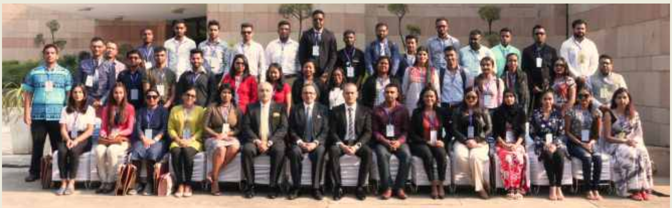
Participants of Know India Programme, 2018