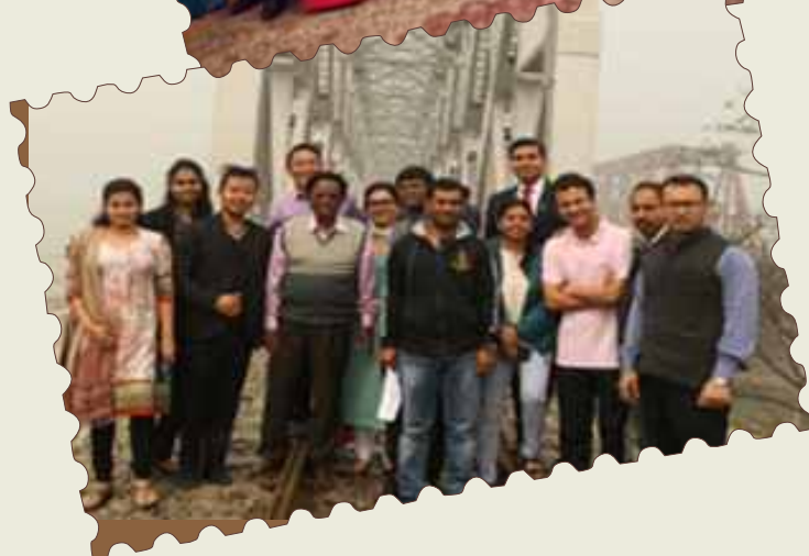
Indian Foreign Service Officer Trainees of 2017 batch visit Bhairab Bridge in Bangladesh on 5 February 2018