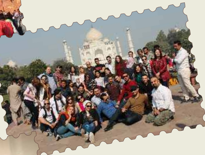
Iraqi & Syrian Diplomats visit Taj Mahal on 20 January 2018